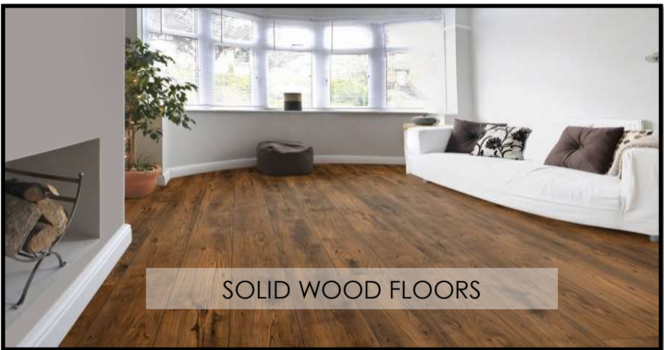
SOLID WOOD FLOORS